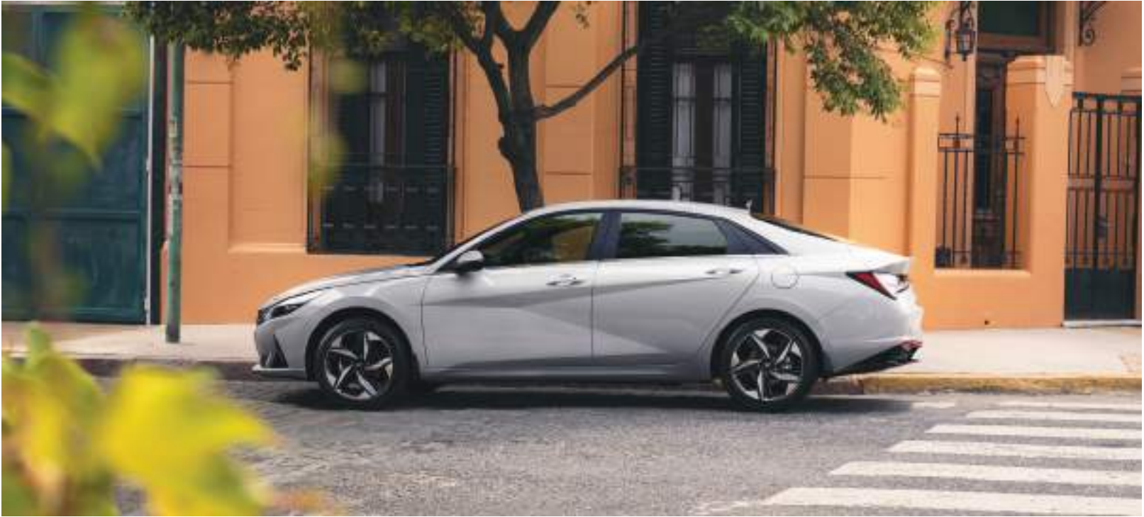
Parametric Jewel Surface Three sections emerge out of three bold-edged lines intersecting at a single point, creating three different colors of light.

The 'Parametric Dynamics' design accentuates geometric aesthetics of the elongated hood and sleek roof lines, completing the visionary and innovative style.