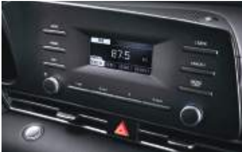
Basic Audio System