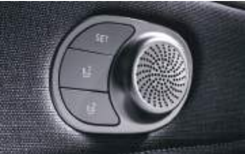
Memory System For Driver's Seat