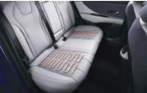
Heated rear seats