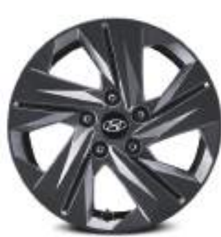
16" Alloy Wheel