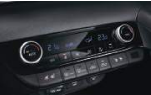
Dual Full Auto Air Conditioner