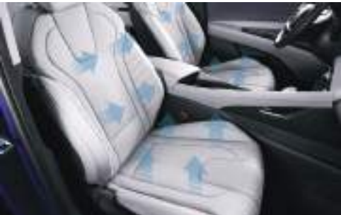
Ventilated Front Seats