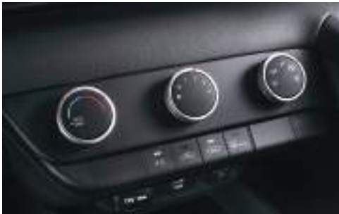
Manual Air Conditioner