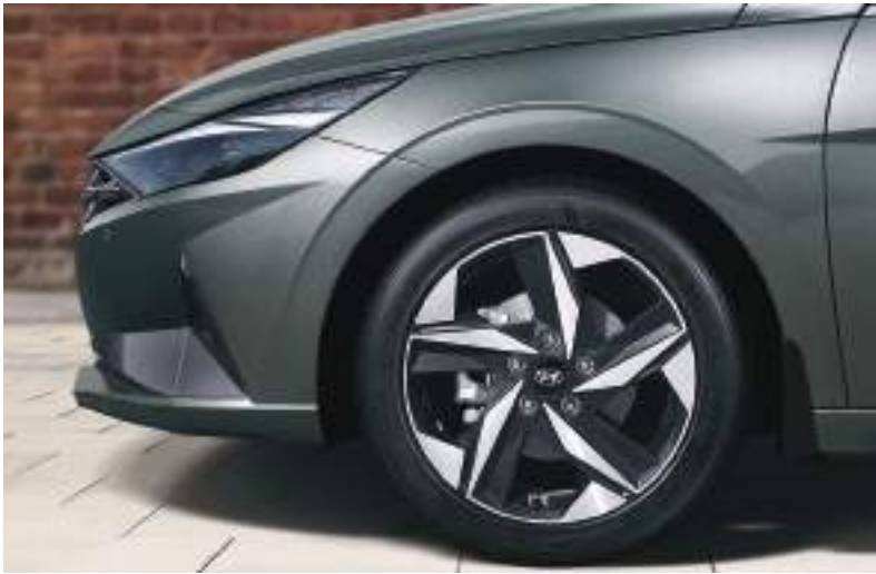
LED Headlights 17" Alloy Wheels & Tires