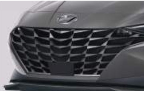
Chrome Radiator Grille