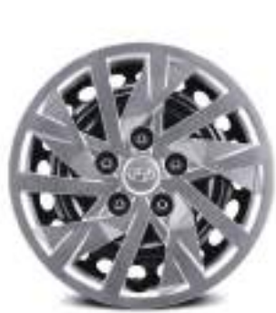
15" Steel Wheel & Wheel Cover