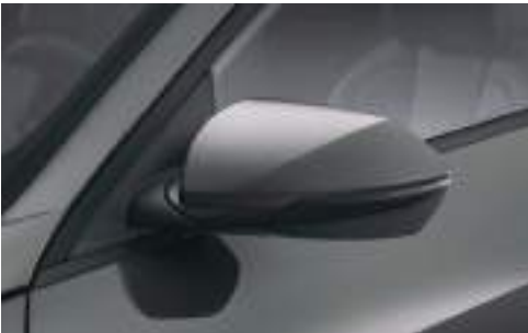
Exterior Sideview Mirrors (heated, power folding, LED turn signal indicators)