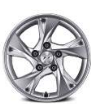
15" Alloy Wheel