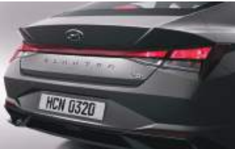
Bulb Rear Combination Lamp