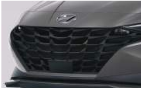
Black Radiator Grille