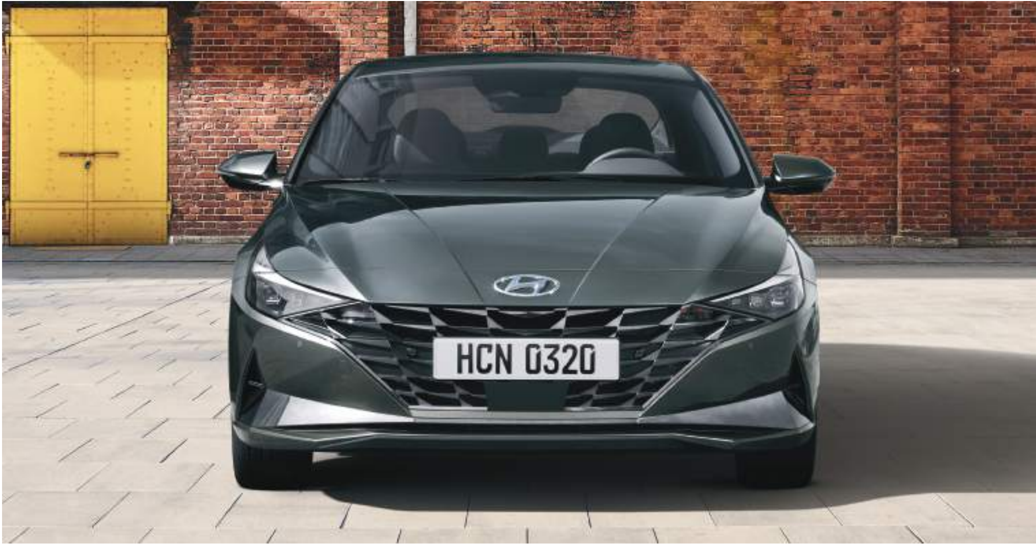
Parametric Jewel Pattern Grille

The stereoscopic Parametric Jewel-pattern design highlights the depth of the front grille, making it resemble diamond-cut gemstones, and the bold and elongated front headlights come together to give Elantra its front sporty look.