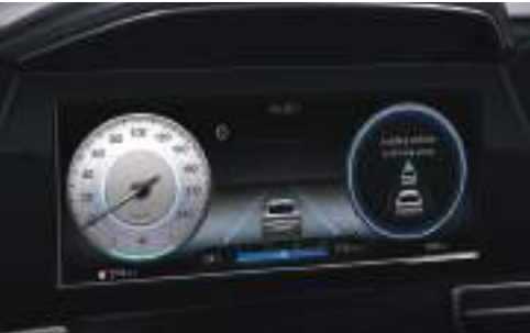
10.25" Full Color Cluster Display