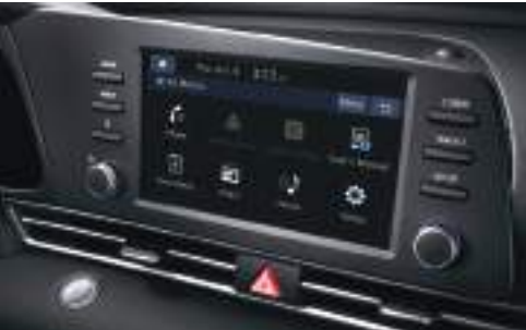
8" Display Audio System (matt, when selecting 4.2" color LCD cluster display)