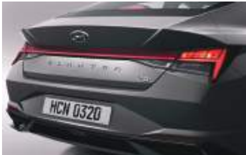
LED + Bulb Rear Combination Lamp