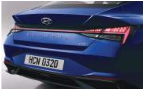
LED Rear Combination Lamp